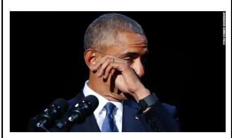
Farewell to the Chief