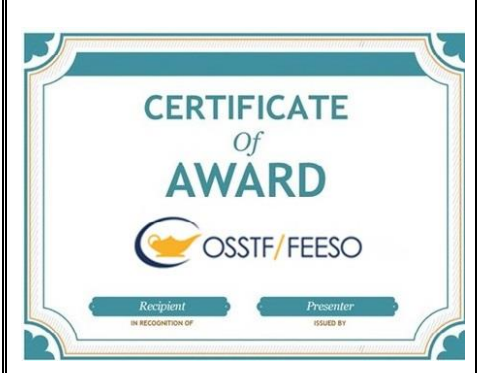
Congratulations to the winners of the OSSTF District 3 Awards!

central table issues will be to the Ontario Labour Relations Board (OLRB), as outlined in Section 28 of the School Boards Collective Bargaining Act. Under the Act, the earliest we can apply to the OLRB for a decision is 45 days after our initial notice to bargain was submitted on April 29.