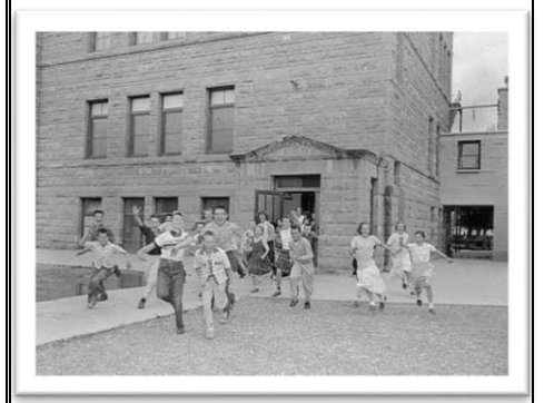
Need I say more???